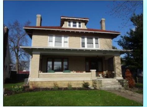
433 N. Broad