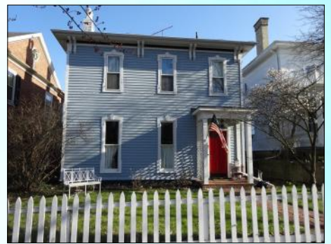
145 E. Mulberry