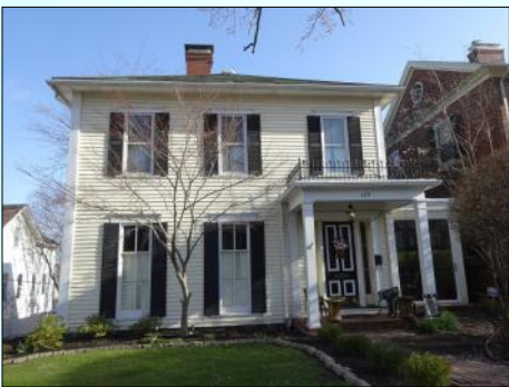
137 E. Mulberry