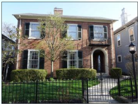
141 E. Mulberry