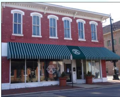
134 S. Columbus