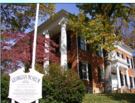
105 E. Wheeling