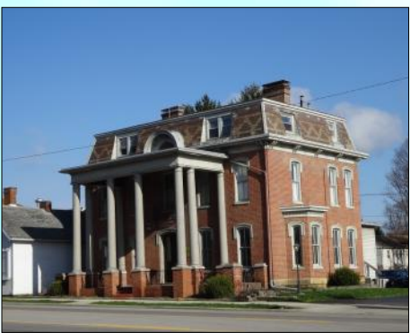
355 E. Main