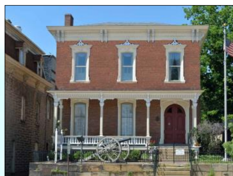
137 E. Main