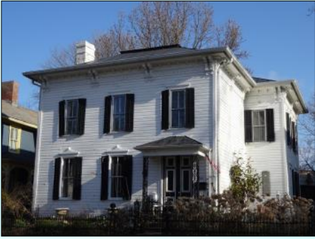
141 E. Wheeling