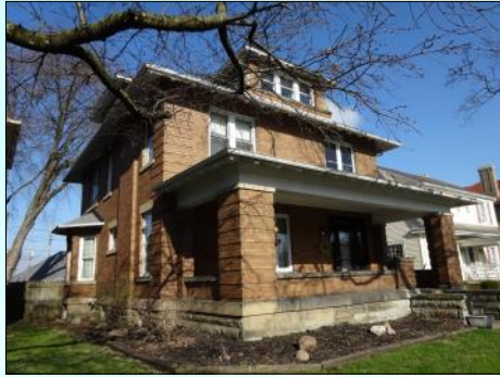
421 N. Broad